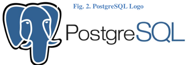
Fig. 2. PostgreSQL Logo

Because of the liberal license , PostgreSQL can be used, modified, and distributed by anyone free of charge for any purpose, be it private, commercial, or academic.