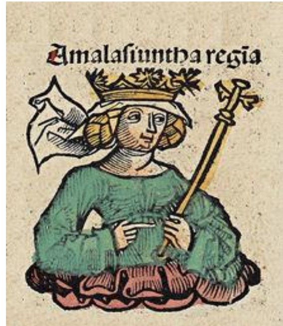
Amalasintha, Queen of the Ostrogoths in Italy.

The purpose of our study the image of the Queen of the Ostrogoths using the writings of Procopius of Caesarea, a 6 th century Byzantine historian.