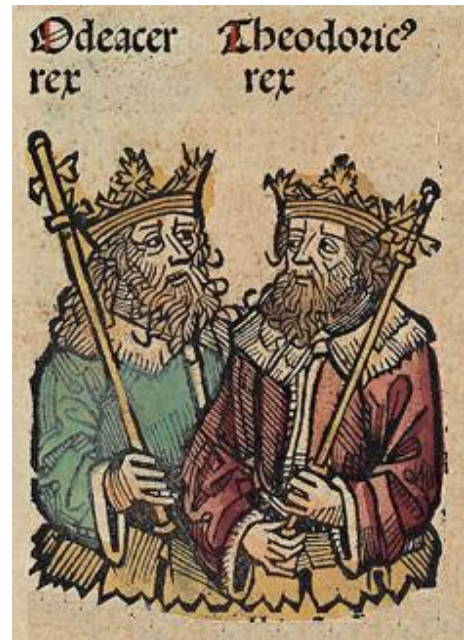
Odoacer and Theodorich. 1493. The Nuremberg Chronicle.

Outside of the empire, which despite religious and cultural differences was still perceived as one, there were not other peoples and states, but barbarians - a priori less civilized than the inhabitants of the empire. In this vein, the borders of the empire are the boundaries of order and law, and as a result, they are the borders of justice. Amalasantha, being a representative of the ancient German union of tribes, namely the Goths, should not have been perceived fair, unless she had overcome her ethnic characterization through her deeds, which Procopius of Caesarea was trying to convey to the readers.