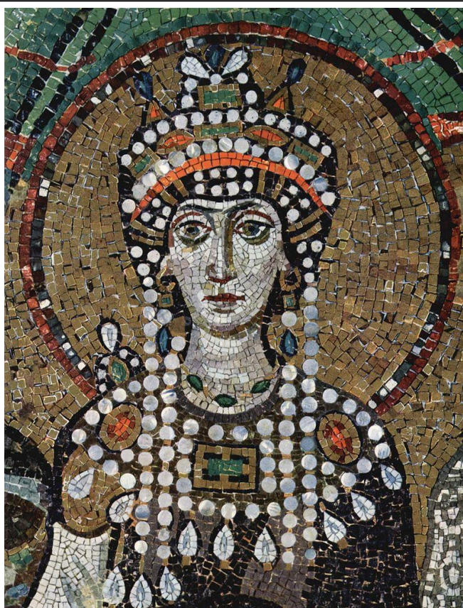
Theodora. The Basilica of San Vitale, Ravenna

3. Find out what goals Procopius of Caesarea pursued to construct such an image